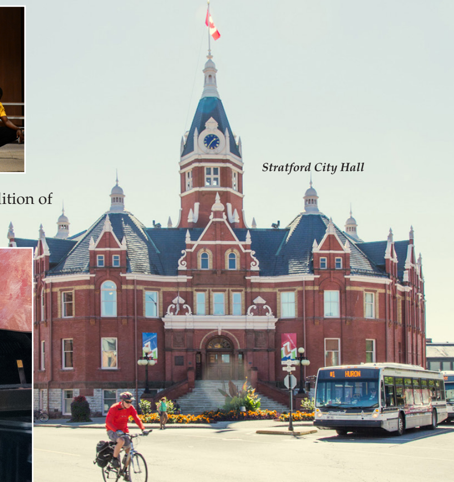
Stratford City Hall