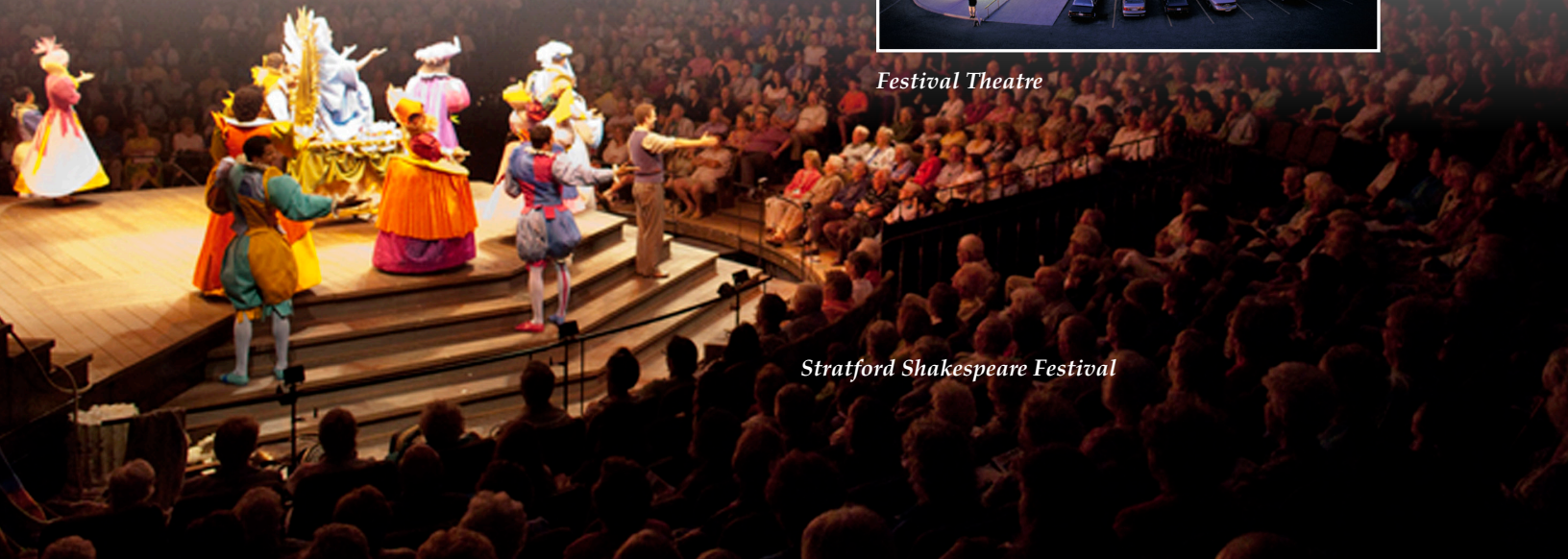
Stratford Shakespeare Festival